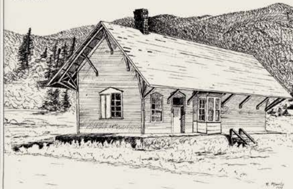
DEPT PITKIN, COLORADO

Sponsored by Pitkin Historic Community Association www.pitkincolorado.com