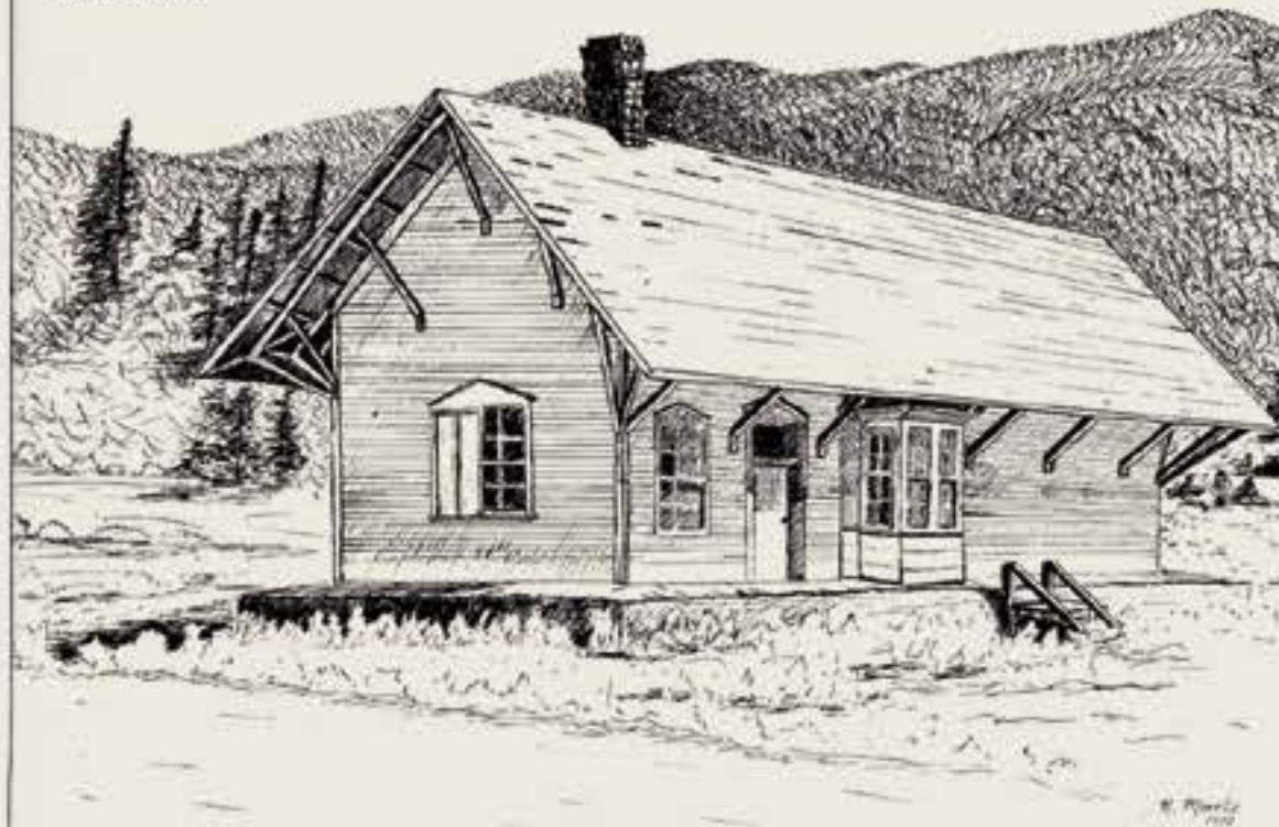
DEPOT PITKIN, COLORADO

Sponsored by Pitkin Historic Community Association www.pitkincolorado.com